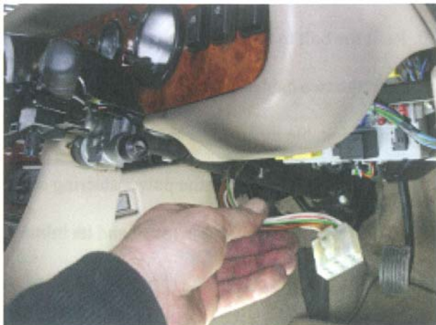
5.1. Undoing cable (1)

5 Undo the two cables to the steering column.