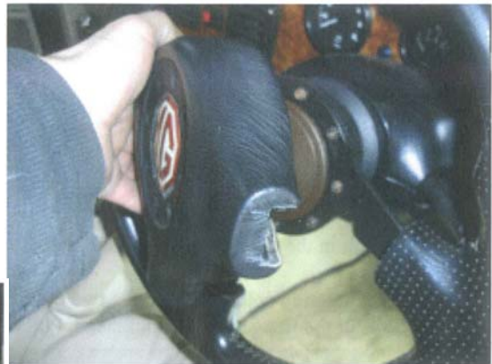
3.1. Remove the wheel motif

3 Remove the horn button. Remove the steering wheel.