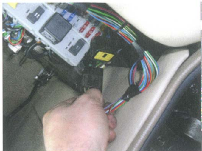
5.2. Undoing cable (2)