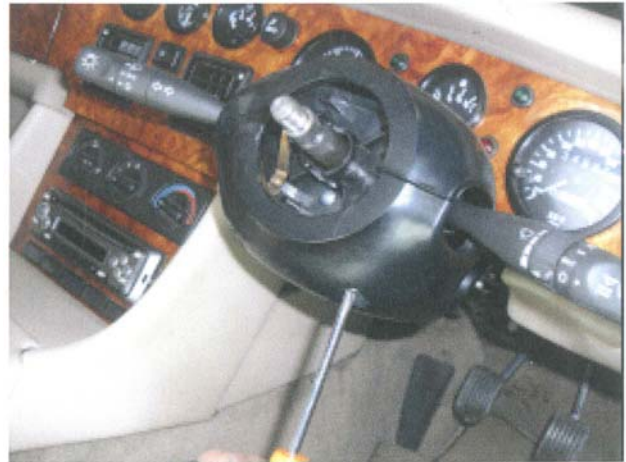
4. Removing stalk unit cover

5 Undo the two cables to the steering column.