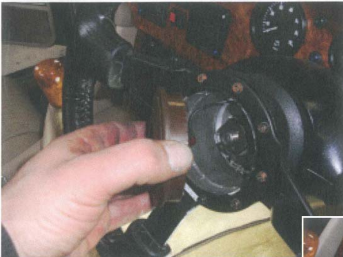
3.2. Removing the horn button.