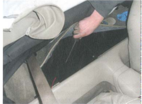
2. Battery location

2 Remove the battery negative lead. The battery is hidden under a hatch behind the right front seat.