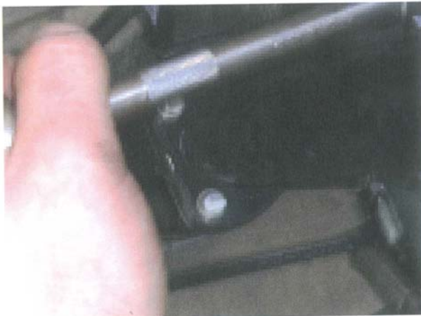
7.2. Bolts in flange

8 Transfer the ignition lock, the indicator and wiper stalk unit, the cables and the covers to the new steering column.