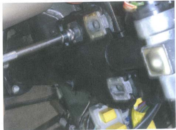
7.1. Removing the bolts in mounting bracket

7 Remove the steering column. Undo the two bolts in the mounting bracket under the fascia panel, then the three bolts in the flange near the bulkhead. Pull the entire steering column from the car.