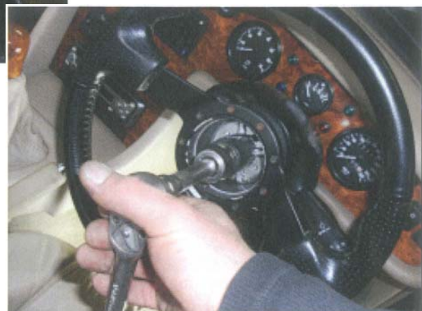
3.3. Removing steering wheel